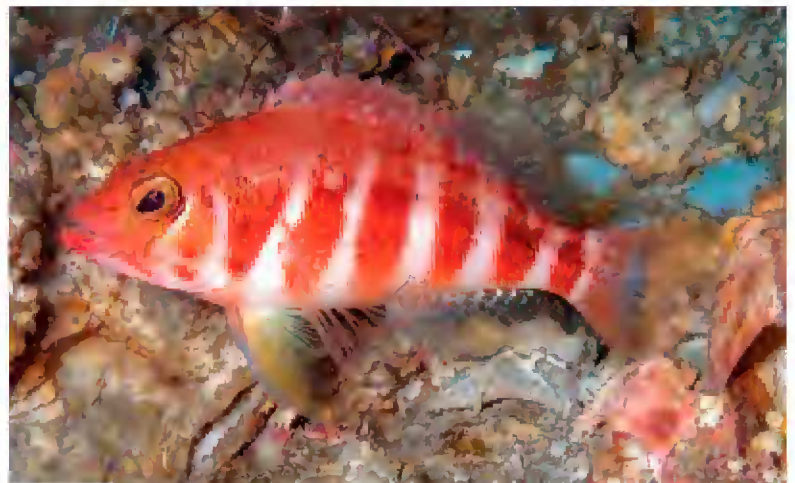
FIGURE 13. Serranus heterurus from Senegal.